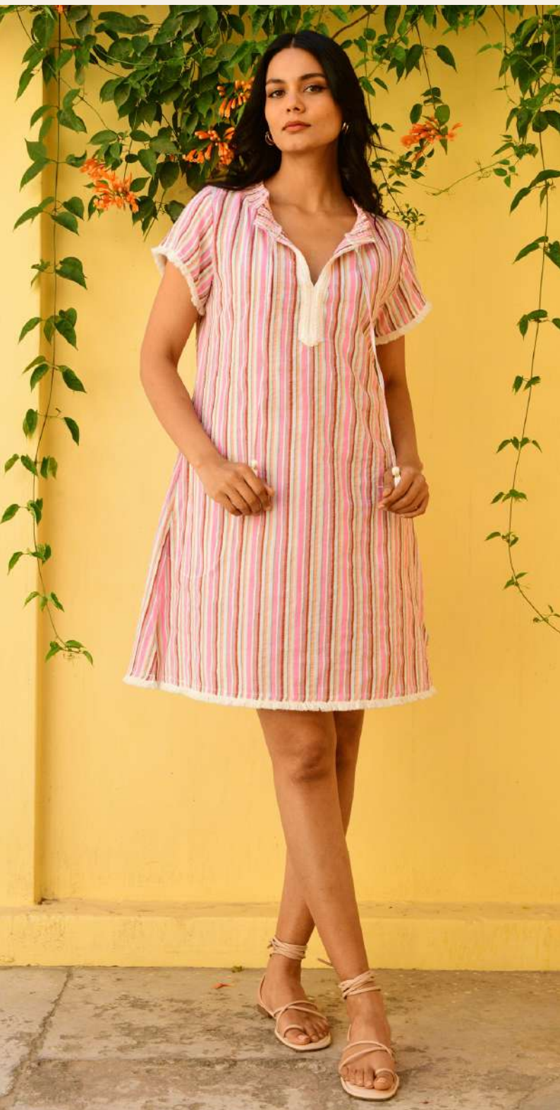
AI-S2416-MULTI KOS DRESS