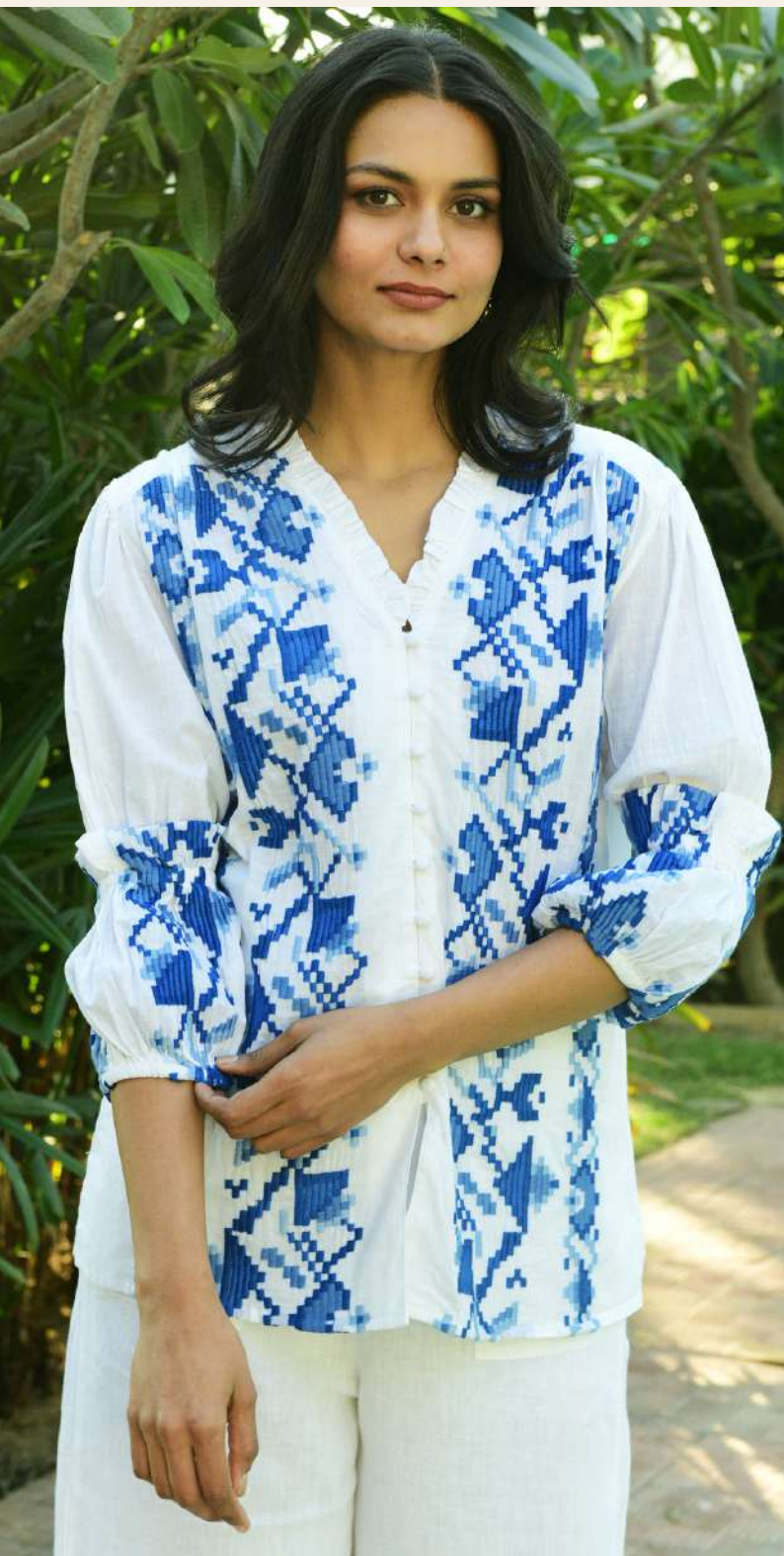
AI-S2413-BLUE PAROS SHIRT