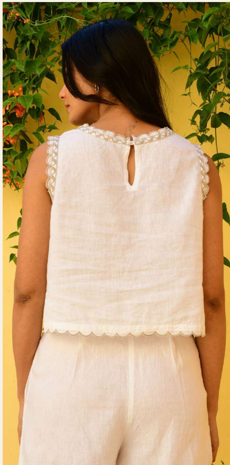
AI-FS2456-WHITE MAYA TOP