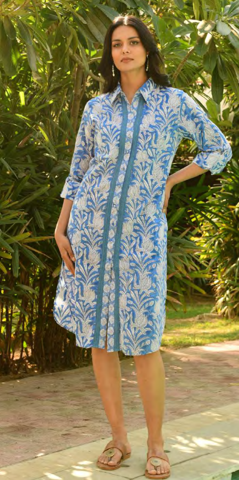
AI-S2443-BLUE LAMU SHIRT DRESS