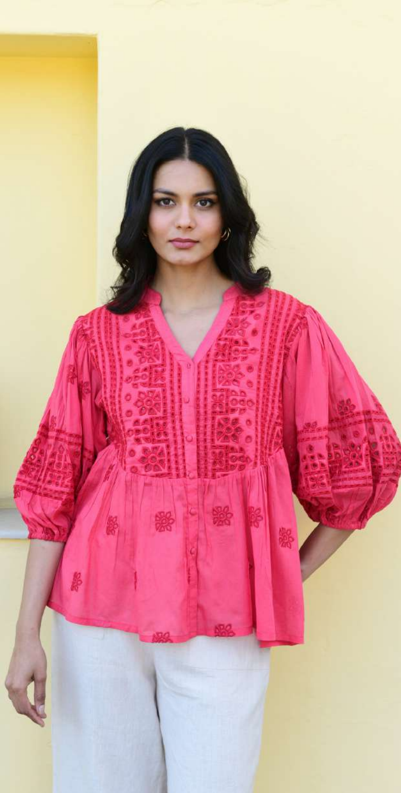
AI-S2458-CHERRY JOY SHIRT